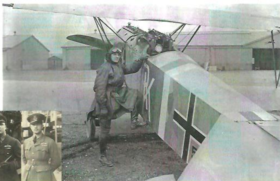
A.E. McKeever climbing into a captured Fokker DVII

Alan McLeod was a pilot in No. 2 Squadron and flew an Armstrong Whitworth F.K.8 on reconnaissance missions over the front lines. He wrote many letters home to his family describing life in the squadron and his experiences flying, many of which are quoted in the book. He won the Victoria Cross as a result of his bravery, having survived being shot down and having saved the life of his