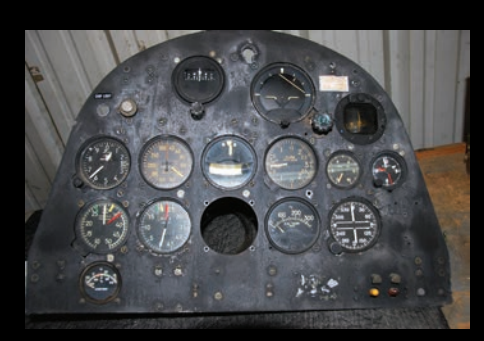
Aero Trader sent all of the instruments out to be overhauled. Thankfully, few needed replacement.