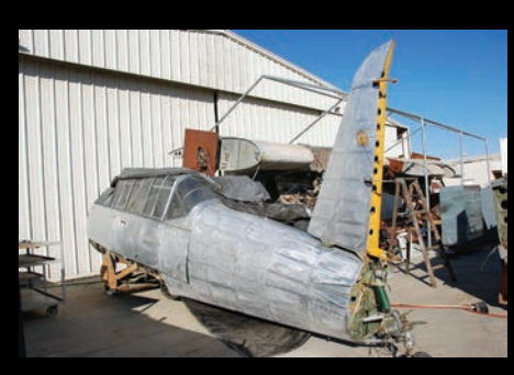
Although the fuselage surfaces looked fine from a distance, close inspection revealed corrosion in certain areas.