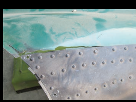
Torn edges in access panels, bad Dzus fasteners, and cracks in the engine cowling all had to be repaired.