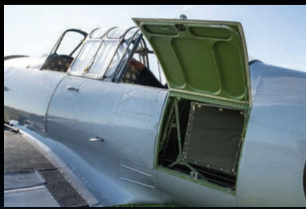
Fuselage baggage area.