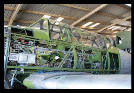
Interior detail work performed by Aero Trader.